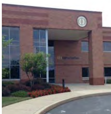
West Chester, Pennsylvania

The Johnson & Johnson Institute West Chester is located at our West Chester, Pennsylvania DePuy Synthes Campus. It is designed to enhance education with an advanced technological infrastructure. This facility has two anatomical labs totaling 1,800 square feet, and two conference rooms with seating for up to 50 guests.