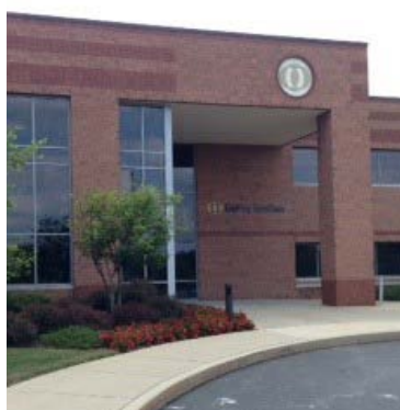
West Chester, Pennsylvania

The Johnson & Johnson Institute West Chester is located at our West Chester, Pennsylvania DePuy Synthes Campus. It is designed to enhance education with an advanced technological infrastructure. This facility has two anatomical labs totaling 1,800 square feet, and two conference rooms with seating for up to 50 guests.