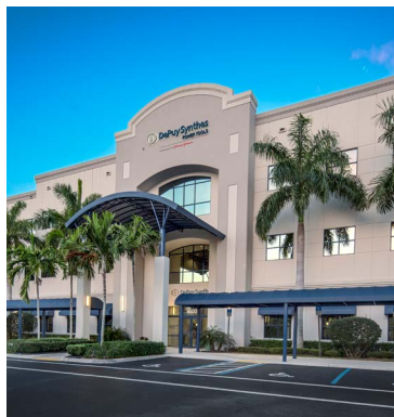
Palm Beach Gardens, Florida

The Johnson & Johnson Institute Palm Beach Gardens is located at our Palm Beach Gardens, Florida DePuy Synthes Campus. It is a 6,000 square foot facility designed to enhance education with an advanced technological infrastructure. This facility has an 18 station anatomical lab, a sub-dividable training room for up to 100 guests, two smaller conference rooms, and indoor and outdoor dining areas.